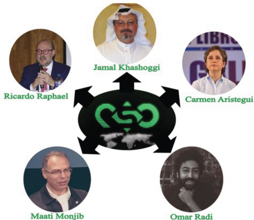
Figure 3: Journalists mentioned that were allegedly targeted with Pegasus spyware.