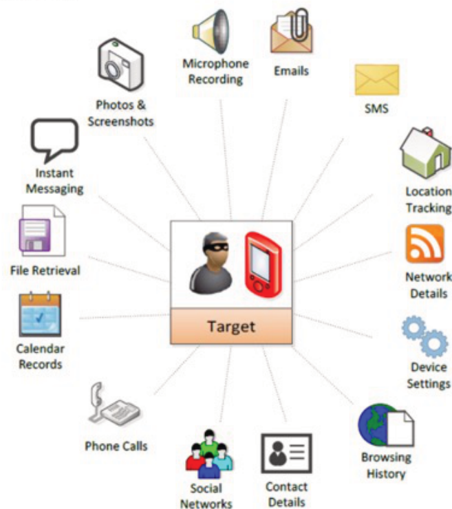
Figure 1: Leaked graphic from an NSO marketing brochure detailing the collecting capabilities of the spyware, used in Kim Zetter’s article “Pegasus Spyware How It Works and What It Collects”

Pegasus spyware capabilities are extensive. As detailed in leaked marketing material from the NSO Group and confirmed through forensic analysis, this spyware has the ability to access photos, videos, text messages, emails, voice memos, call history, and browsing history; it can remotely enable camera and video features as well as track a device’s location through GPS movements. 16